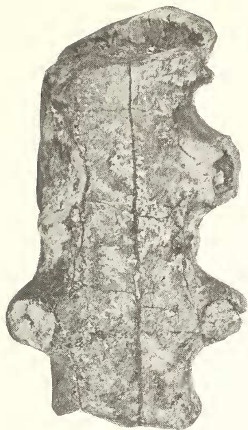
TEXT-FIG. 2. Fragment of dentary of cf. Euthecodon (KNM-RU 2585) from the Gumba Red Beds, Gumba Peninsula, Rusinga Island, Kenya. \times 1.2 .